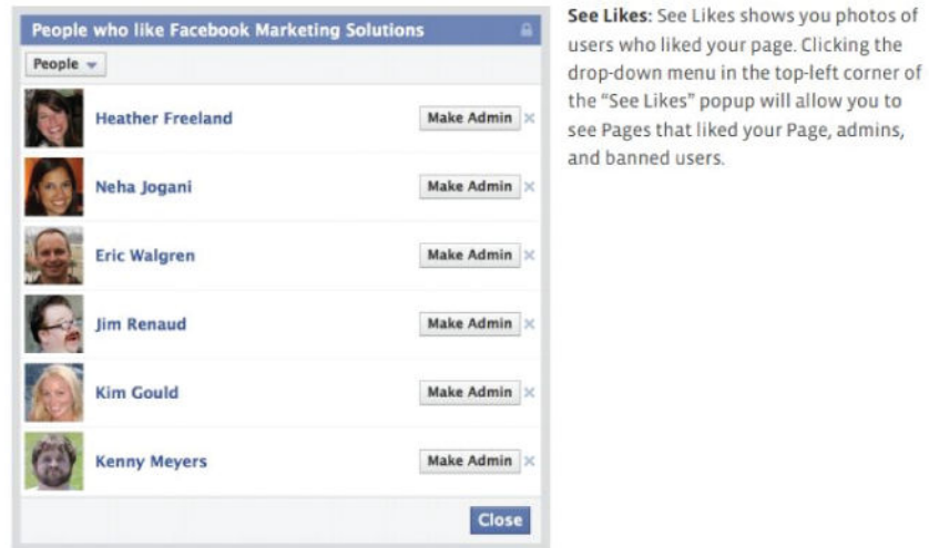
Fig. 4. FaceBook Insights Screenshot of Users that “Like” Your Page.